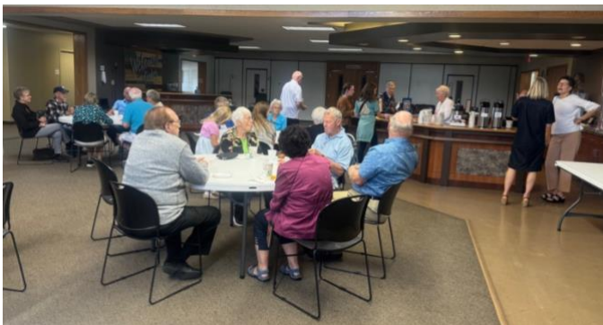
Second Sunday Socials are back!