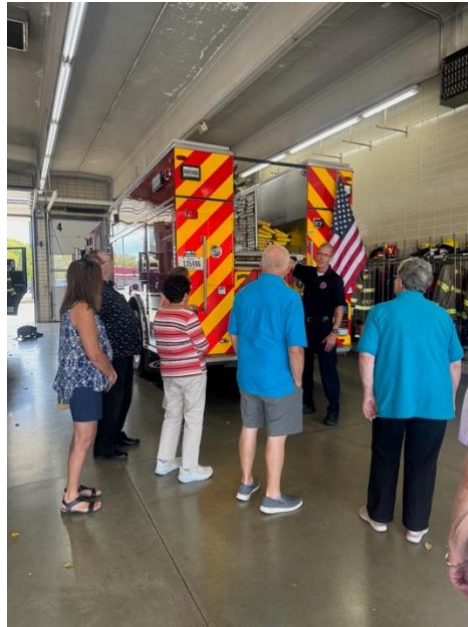
The tour of Waterloo Firehouse #1 continues.