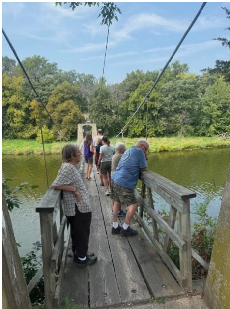
Hiking Club explores the swinging bridge in Iowa Falls.