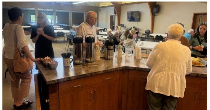
Join us between services on Sunday, October 13 for the next one!