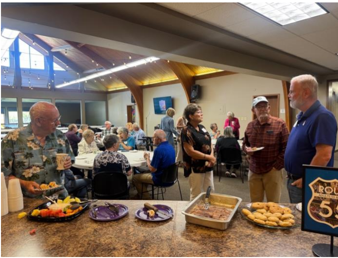
The final Second Sunday Senior Social was very enjoyable. We'll be taking a break during the summer months and will resume once school is back in session.