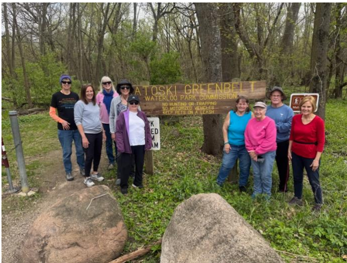
Route 55 Hikers caught the blue bell season just right! Katoski Greenbelt was a brilliant carpet of blue! It was a wondrous sight!