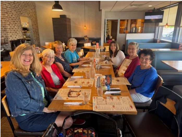
Monthly Lunch outings are back! The ladies are enjoying some fellowship and food at the Village Inn.