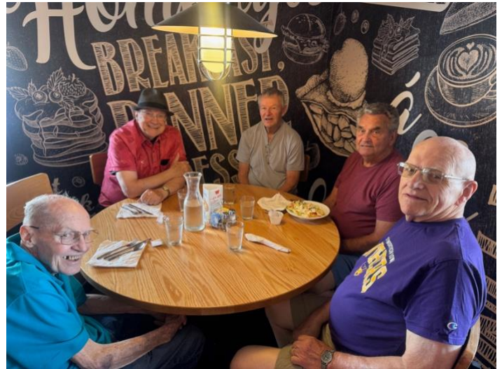
The guys are looking forward to a free piece of pie to go along with their lunch. We love Wednesday's at Village Inn!