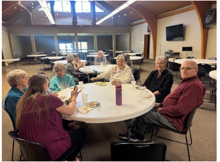
Refreshments are enjoyed after the singing.